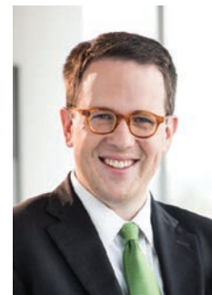
G.T. Bynum Tulsa Mayor (2017 Speaker)