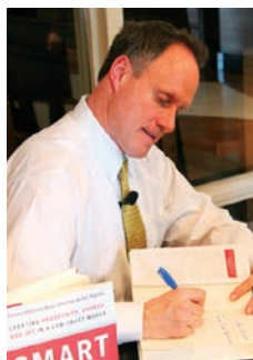
Stephen MR Covey Author (2012 Speaker)