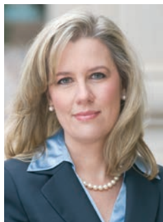
Cynthia Cooper WorldCom Whistleblower (2014 Speaker)