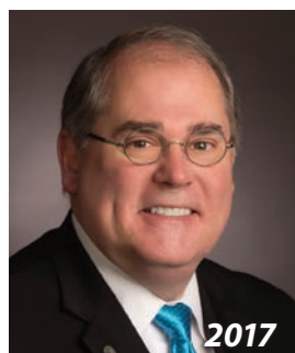
Pierce Norton ONE Gas